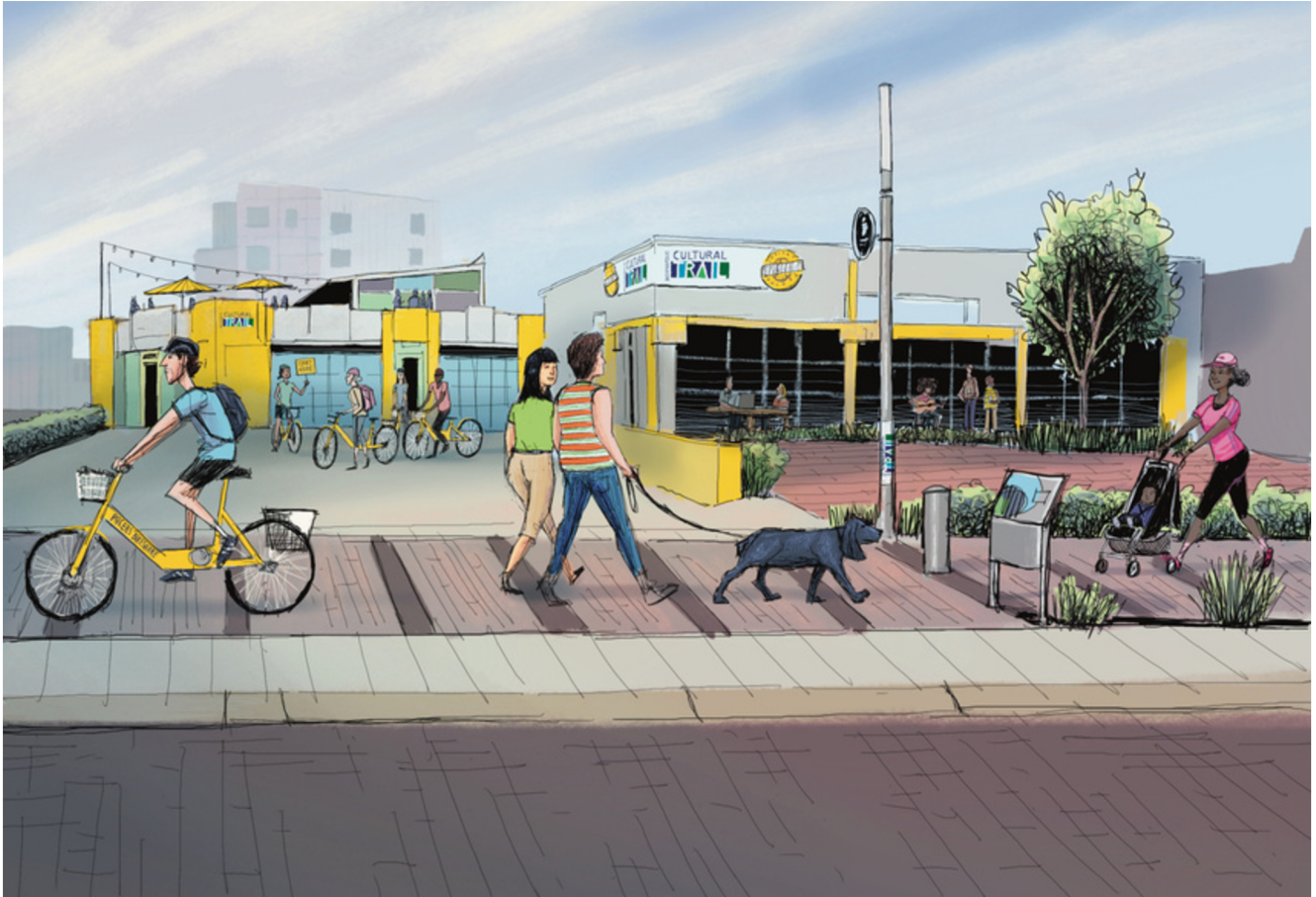
Illustration by Jingo de la Rosa

In 2024, we also announced plans to expand our headquarters and establish a Cultural Trail welcome center along the Glick Peace Walk at 132 W. Walnut Street. This project will double our operational space, allowing us to grow our programs, support the expanding Pacers Bikeshare program, and create a welcoming community hub for all who use the Cultural Trail. To support this bold vision, we launched a $2 million fundraising campaign to ensure that the Cultural Trail remains a vibrant, sustainable resource for generations to come.